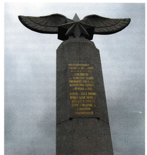
The top of the Caudron brothers' Memorial Column near le Crotoy.