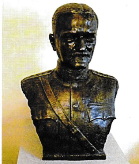
Pershing Bust, 4th floor, Pershing Hall Hotel, Paris.