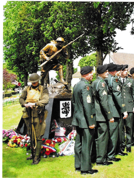
'Doughboy' statue, Cantigny 2008, with 'Pershing's Doughboys' re-enactor and current soldiers of US 1st Division.