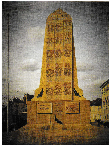
Is-sur-Tille American Memorial.

"We don't know of any overseas monuments dedicated to American deaths in the flu per se, but it is useful to examine monuments erected at the sites of US Army hospitals. One such example is the town war memorial of Is-sur-Tille in the Burgundy region of France. It was erected in 1923 and based on the old chimney of Camp Williams Officers Mess. This town was the site of Camp Hospital 41 that operated from 11 March 1918 until 23 May 1919. It was a 500 bed hospital that served Camp Williams, which numbered up to 24,000 troops. This was not a combat zone, but was a transportation hub and regulating station. On one entire side of the memorial, the town has listed all of the