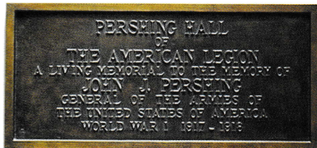
American Legion Plaque to General Pershing, Pershing Hall, Paris.