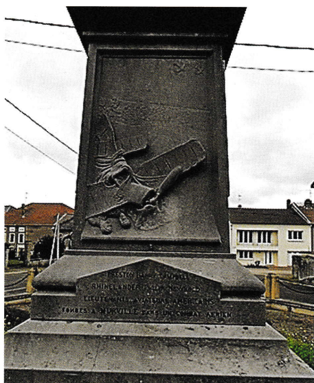
Monument to American Lieutenants Harry C. Preston and Philip N. Rhineland, Murville. See also: https://www.uswarmemorials.org/html/monument_details.php?SiteID=483&MemID=750

Lil describes Favourite No. 2 as ‘it amazes and delights me every time I see it. It is the town War Memorial of Murville in France. A bomber was shot down just outside of the town, killing two American aviators. The town recognized them on the Monument aux Morts . But check out the sculpture! Graphic, gruesome, wonderful!’ The concrete monument has a three-tier base with an elongated middle section that contains the names of the town’s war dead on its two sides. On top of the memorial is a statue of a Poilu holding a rifle. On the back side (south), there is a graphic scene carved into the monument depicting two American airmen, Lieutenants Harry C. Preston and Philip N. Rhineland , upside down underneath their crashed plane. These two U.S. airmen were shot down on September 26, 1918 by the German Richthofen Squadron during the great Argonne offensive. While they were providing cover fire for the rest of their squadron’s retreat, Rhineland and Preston’s DH4 bombing